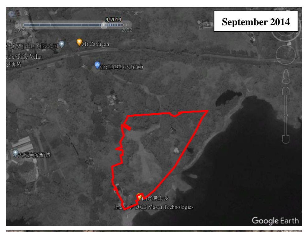
Figure 1-4 According to the aerial photos from Google Earth, the application site (marked in red) has been subject to land formation and vegetation clearance since 2014

電話 Tel.:(852)2728 6781 傳真 Fax.:(852)2728 5538 電子郵件 E-mail:cahk@cahk.org.hk