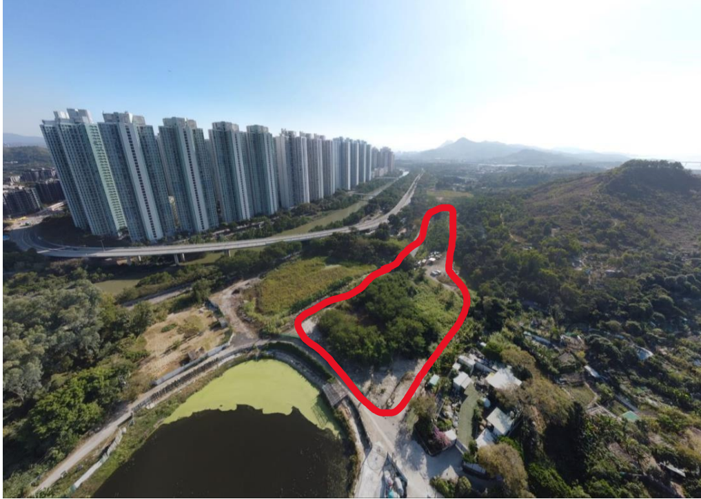
Figure 2 Existing condition of the proposed rezoning site (marked in red)

會址: 香港新界葵涌貨櫃碼頭路 77-81 號 Magnet Place 一期十三樓 1305-6 室 電話 Tel.:(852)2728 6781 傳真 Fax.:(852)2728 5538 Add.: Units 1305-6, 13/F, Tower 1, Magnet Place, 77-81 Container Port Road, 電子郵件 E-mail:cahk@cahk.org.hk Kwai Chung, New Territories, H.K. 網址 Website:www.cahk.org.hk