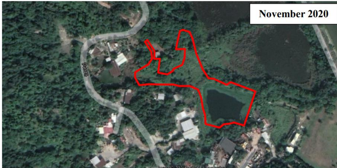
Figure 2-4 According to aerial photos and our observation in May 2021, this site (marked in red) has been subject to land formation and vegetation clearance (marked in blue). It is suspected that this is a case of “destroy first, build later”