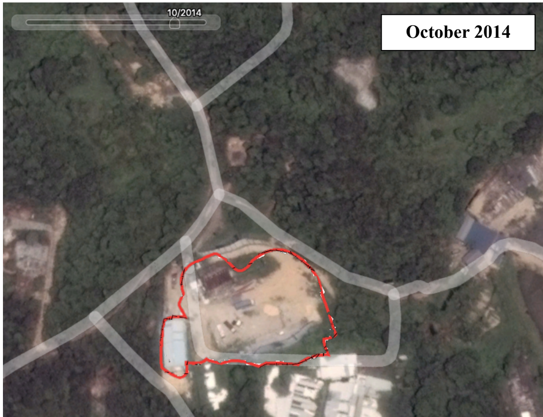
Figure 1-3 The proposed site (marked in red) has been subject to land formation and vegetation clearance. It is suspected that this is a case of “destroy first, build later”

會址: 香港新界葵涌貨櫃碼頭路 77-81 號 Magnet Place 一期十三樓 1305-6 室 電話 Tel.:(852)2728 6781 傳真 Fax.:(852)2728 5538 Add.: Units 1305-6, 13/F, Tower 1, Magnet Place, 77-81 Container Port Road, 電子郵件 E-mail:cahk@cahk.org.hk 網址 Website:www.cahk.org.hk