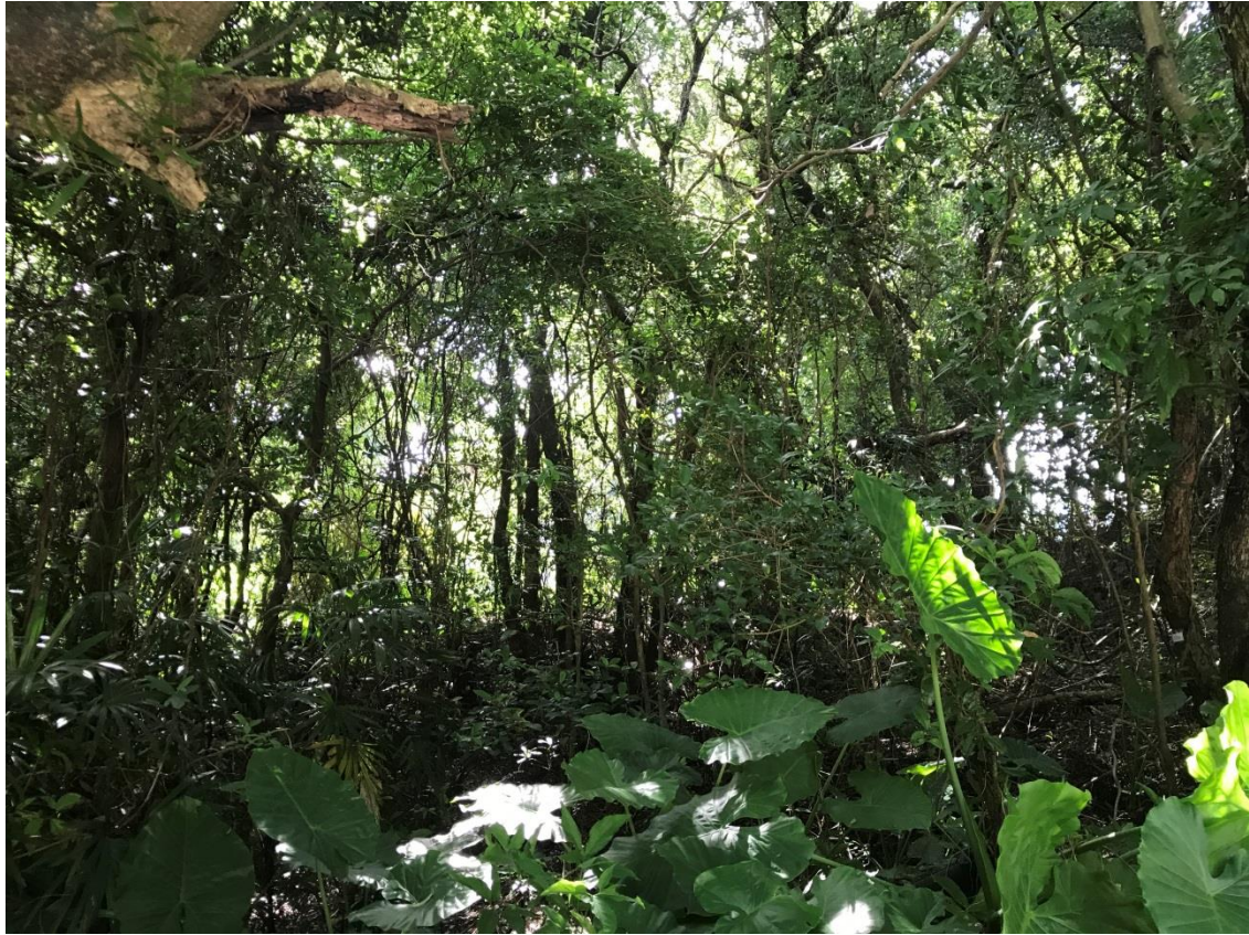
Figure 2. Application site with dense vegetation

Registered Name 註冊名稱 : The Conservancy Association 長春社 (Incorporated in Hong Kong with limited liability by guarantee 於香港註冊成立的擔保有限公司)