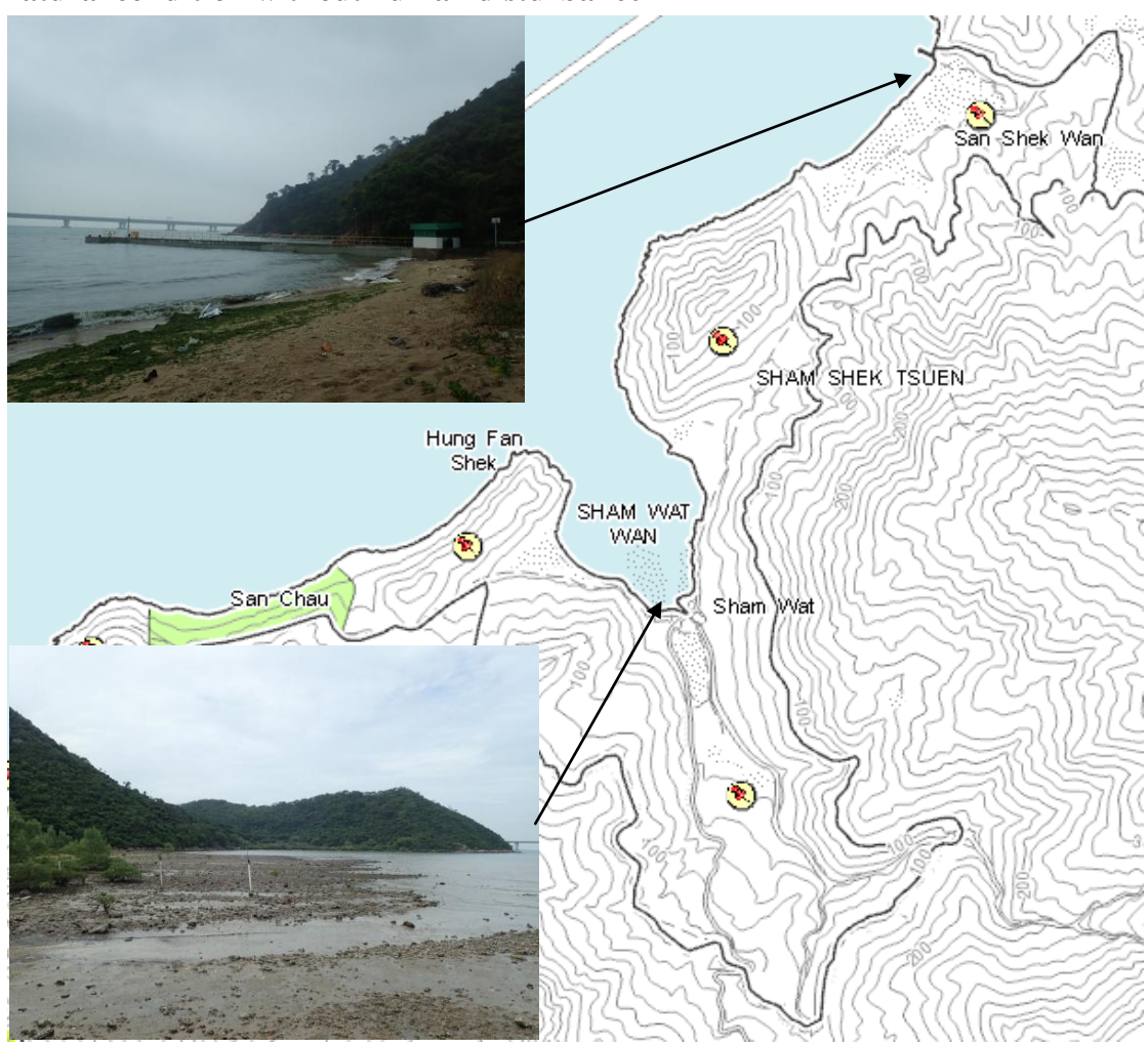
Figure 1The coastline along the northern part of the Plan Area is still innatural condition without human disturbance

電話 Tel.:(852)2728 6781 傳真 Fax.:(852)2728 5538 電子郵件 E-mail:cahk@cahk.org.hk