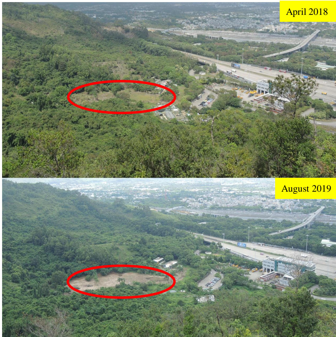
Figure 4-6 Changes in vegetation cover in the site and its surrounding area (circled in red)