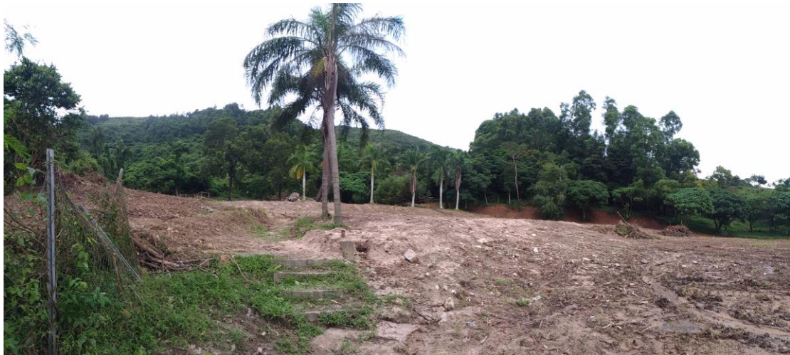
Figure 7 and 8 During our site visit in late August 2019, it was discovered that a considerable amount of vegetation inside the site and its surrounding area