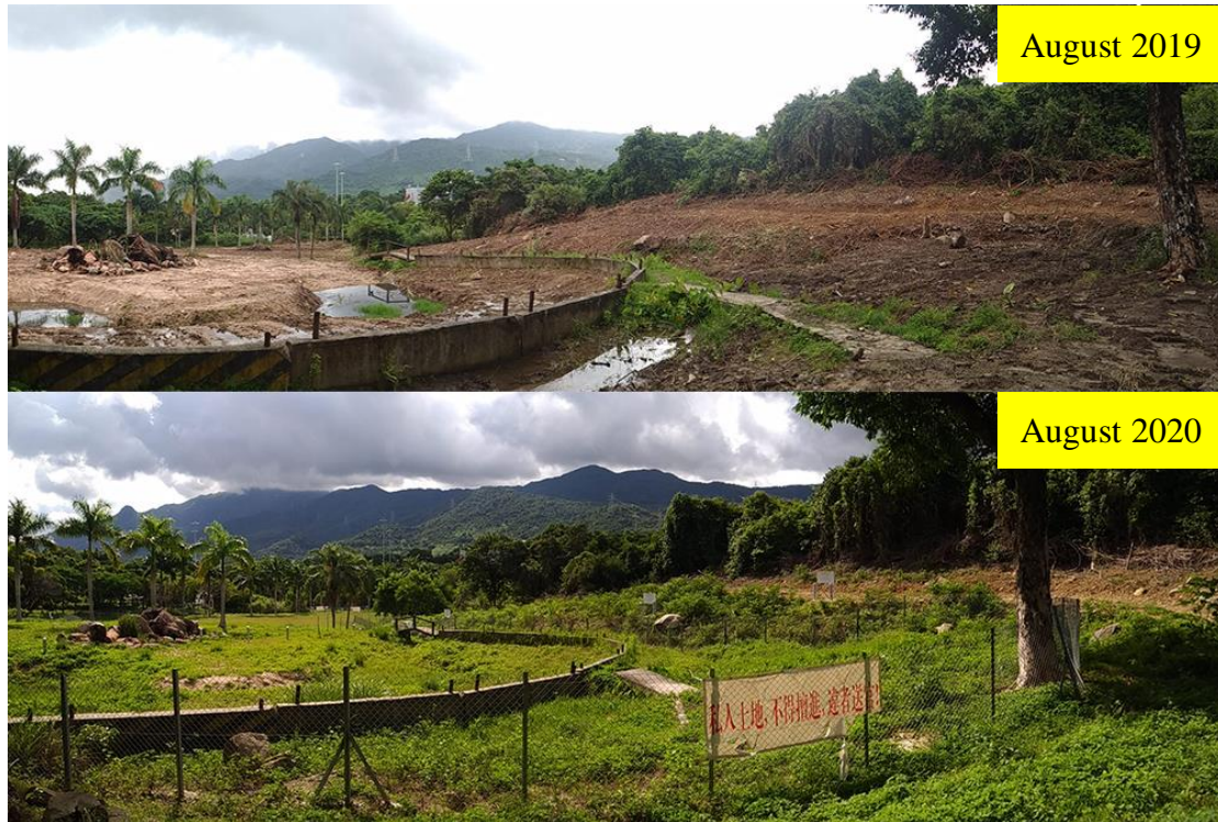
Figure 9 and 10 By comparing the condition of August 2019 with August 2020, signs of land excavation and vegetation clearance can still be observed, even though weeds were overgrown in some of the areas