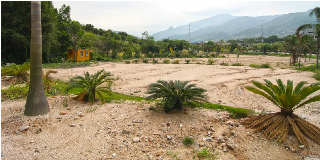
Figure 2 and 3 From our record, pond filling have be spotted since 2008 in the site and its adjacent area. Ponds and agricultural land have be filled with construction and demolition waste. Photos in 2009 have shown that construction and demolition wastes were still not removed from the site.