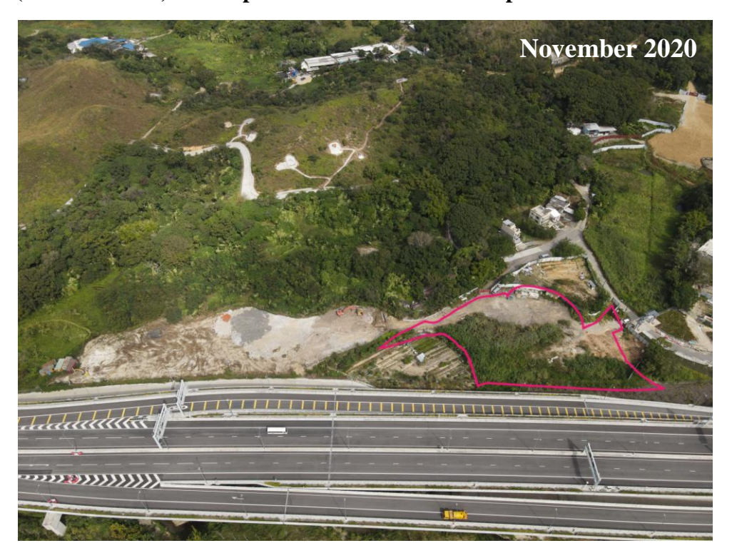
Figure 2 According to our site observation in November 2020, the site (marked in red) is now paved with concrete and asphalt

The Conservancy Association 會址: 香港新界獎涌貨櫃碼頭路 77-81 號 Magnet Place —期十三樓 1305-6 室 Add.: Units 1305-6, 13/F, Tower 1, Magnet Place, 77-81 Container Port Road, Kwai Chung, New Territories, H.K. 網址 Website:www.cahk.org.hk