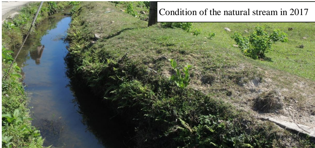
Figure 10-11 From our observation, suspected illegal discharge can be spotted connecting to the natural stream, while the river bank has been largely modified (circled in red)