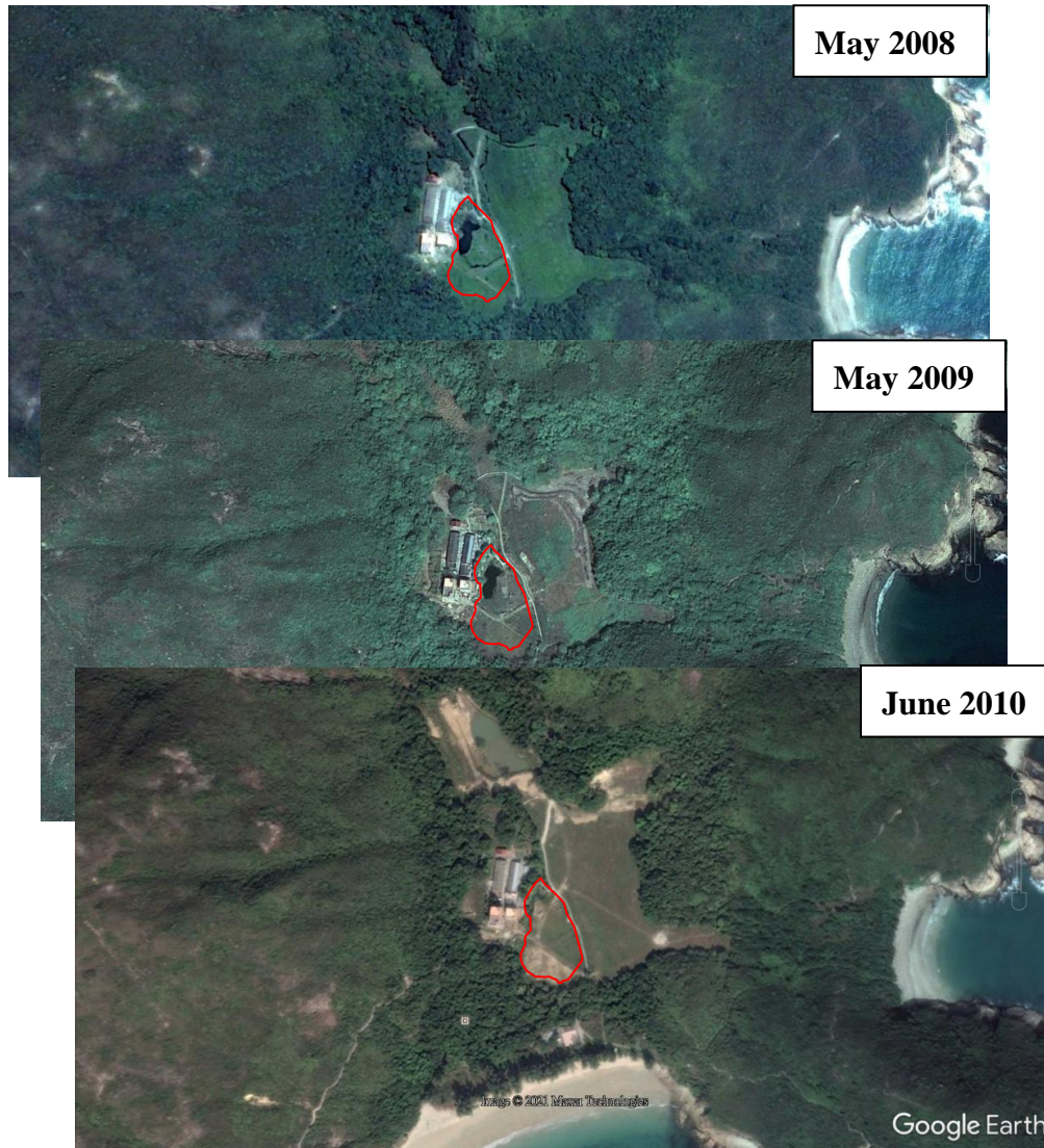
Figure 1-6 According to aerial photos, the site (marked in red) was subject to land formation and vegetation clearance in the past