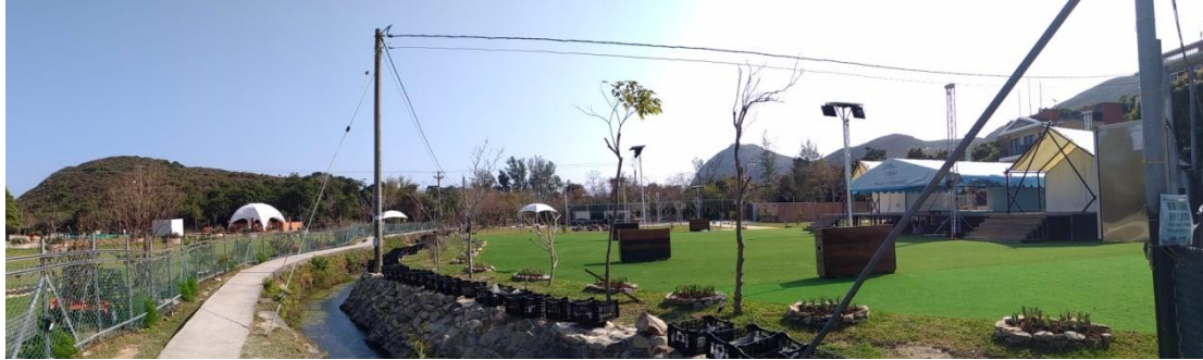
Figure 7-9 Site condition observed in mid-February 2021