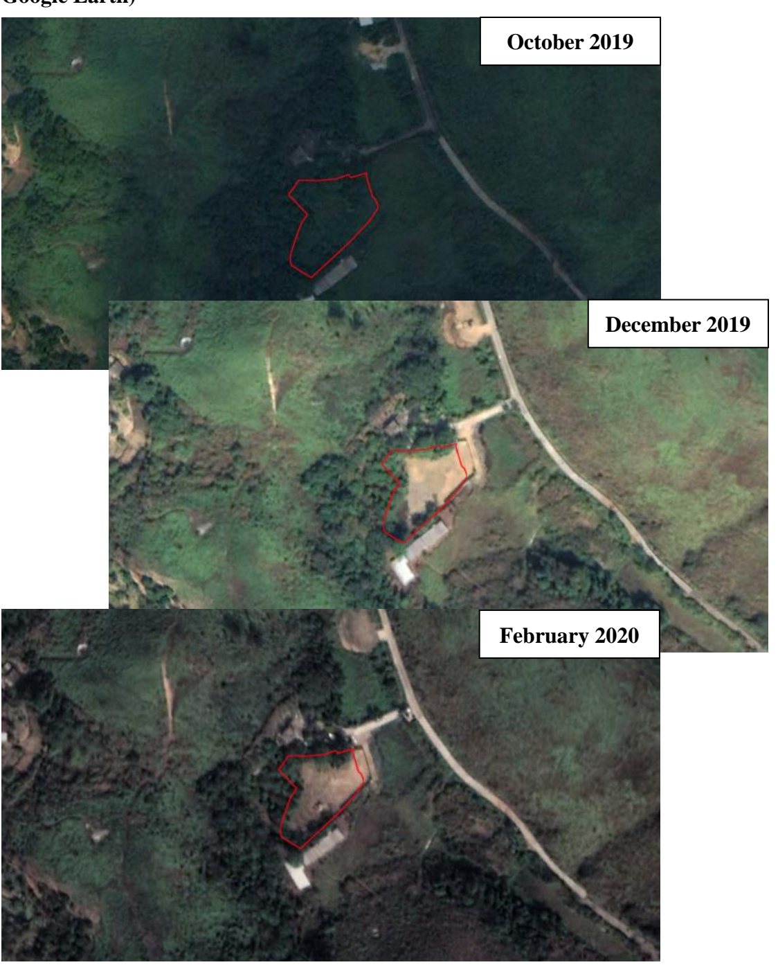
Figure 4-6 According to aerial photos, the subject site (marked in red) was subject to land formation and vegetation clearance in the past

電話 Tel.:(852)2728 6781 傳真 Fax.:(852)2728 5538 電子郵件 E-mail:cahk@cahk.org.hk